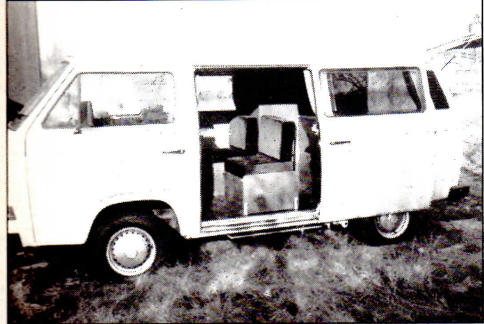
Rear seats in travelling position, with gangway between.