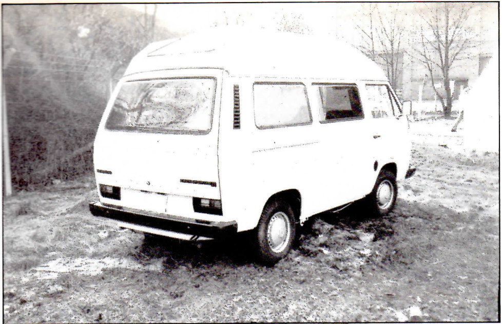
Smoothly contoured roof has luggage rack at rear.