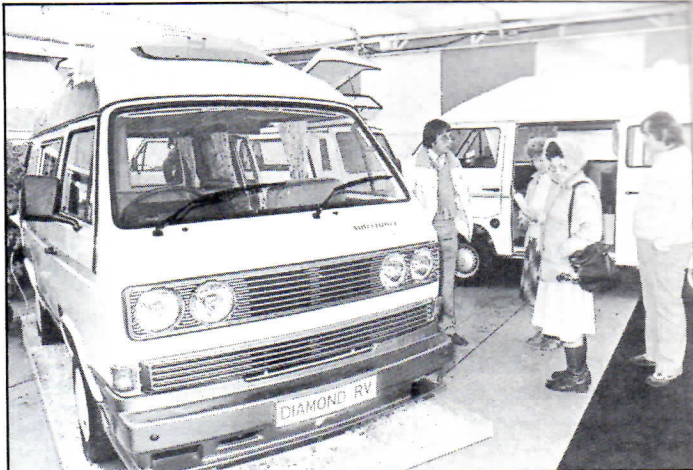
The new Diamond Elite aroused great interest.

There was an excellent selection of pre-owned British coachbuilt units including VW Hilton Motorhomes, Glendales, Advanturas and Travelhomes, plus many used motorcaravans.